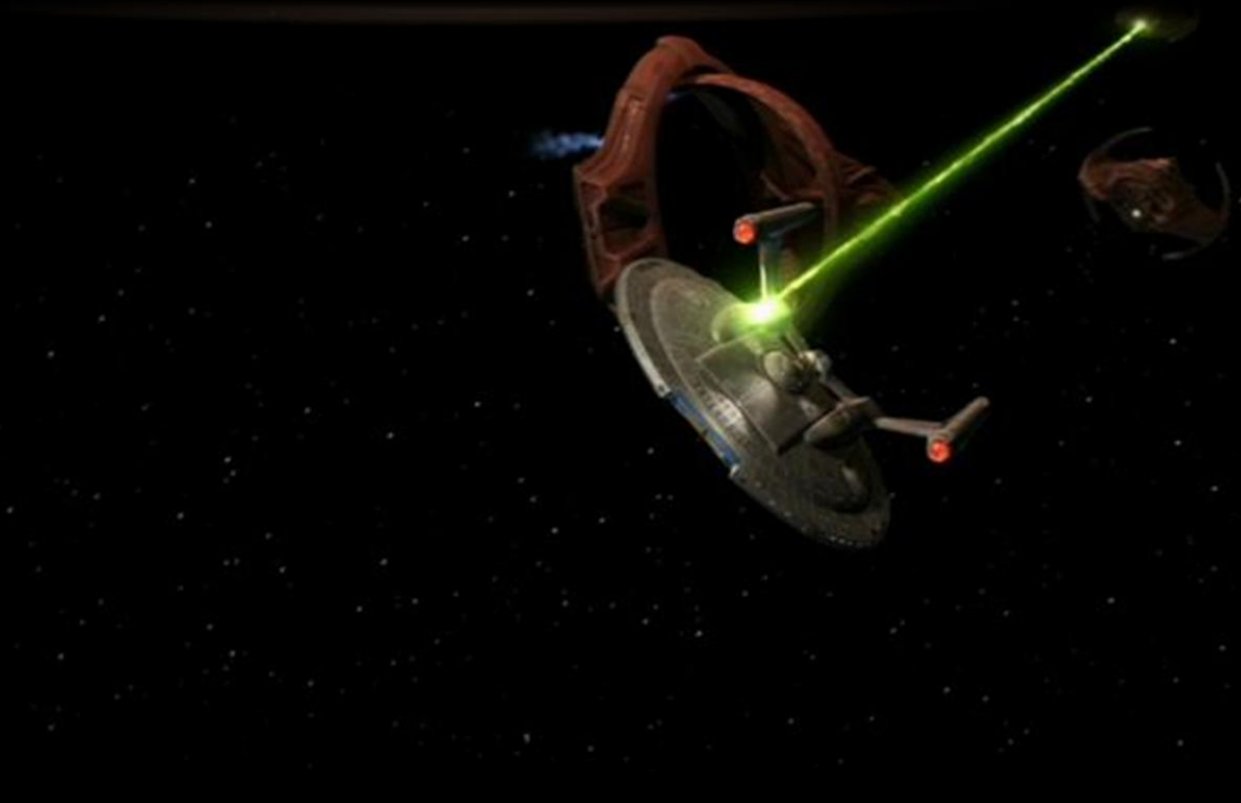
The Wey'Sohl firing one of its plasma weapons.