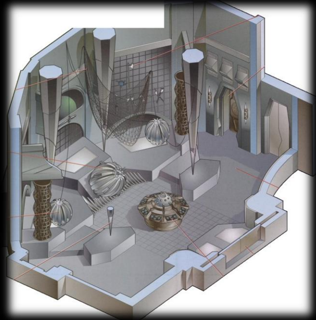
Interior of the Destroyer

The Destroyer, like all Hirogen vessels, comes equipped with special hull plating that makes the ship difficult to detect with sensors, as well as making it difficult for enemy starships to lock onto.