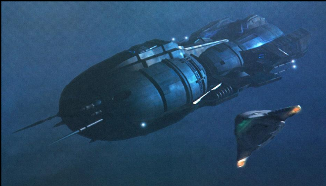
Iden's Ship alongside the Delta Flyer.