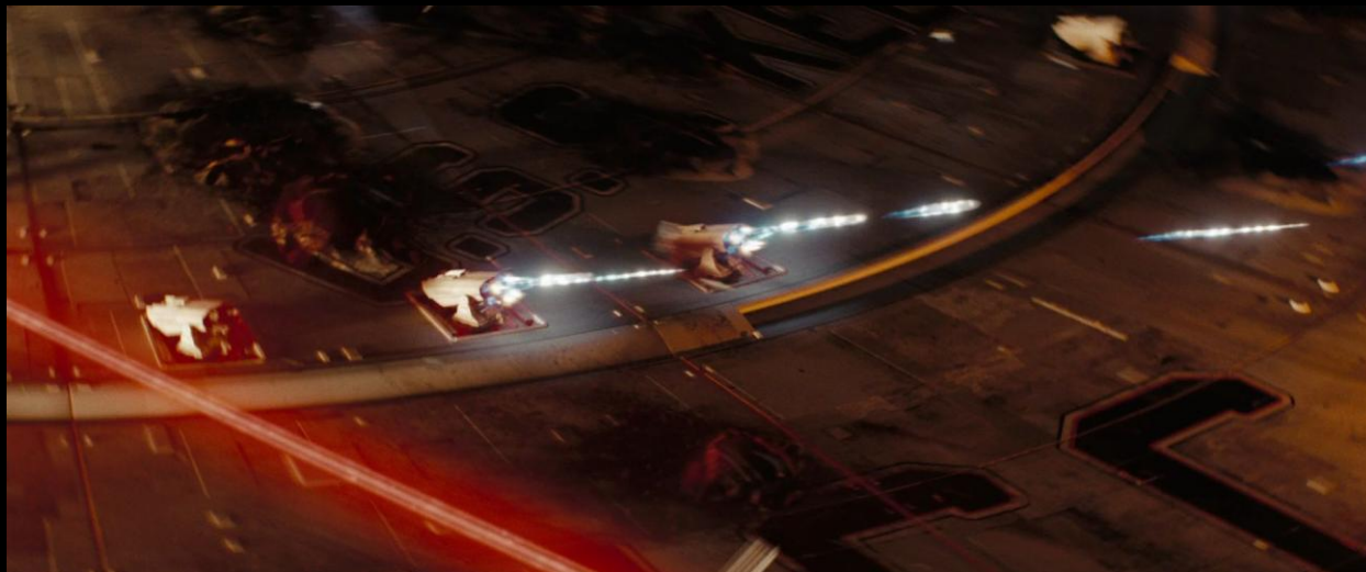
The U.S.S. Kelvin firing phasers (red) and photon torpedoes (blue)